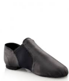
Split-sole jazz shoe

Dance Uniform: To move safely, avoid wardrobe malfunctions, and not wear sweaty and smelly clothes for the remainder of the students' day, the dance department requires students to dress out in a dance uniform (uniform varies by dance form). Each student is required to bring dance clothes to class every day. Clothes must be non-restrictive, allowing the student to move freely. This may include leotards, form-fitting plain t-shirts (no distracting logos, pictures, quotes, etc.), and tank tops, along with sweatpants (not baggy, as I need to see if the knee is in the proper placement and the student will not get injured), gym shorts, or leggings/yoga pants. All students need a pair of black split sole jazz shoes (all items available at www.discountdance.com ).