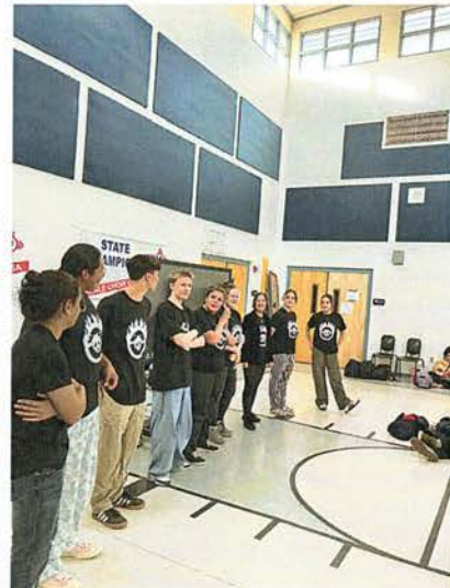
Community Hot Cocoa Celebration- pre-finals kick off Enter the PAPA Dome Screening: