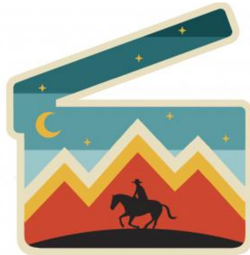
LeRoy Grafe "Sunset over Cerrillos Hills"